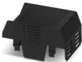
Component housing, connection opening on one side, Upper part, color: black, width: 45 mm

Please be informed that the data shown in this PDF Document is generated from our Online Catalog. Please find the complete data in the user's documentation. Our General Terms of Use for Downloads are valid ( http://phoenixcontact.com/download )