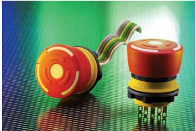
E-Stops may require shorter behind-panel depth.

“Check what international and U.S. standards, performance ratings, and codes apply for your application.”