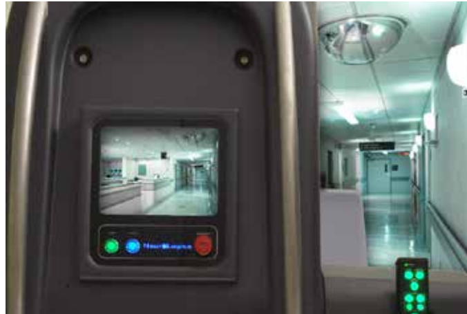
Illuminated E-Stop used in medical diagnostic treatment.

“Modern applications often demand a slimmed down E-Stop with 16mm mounting.”