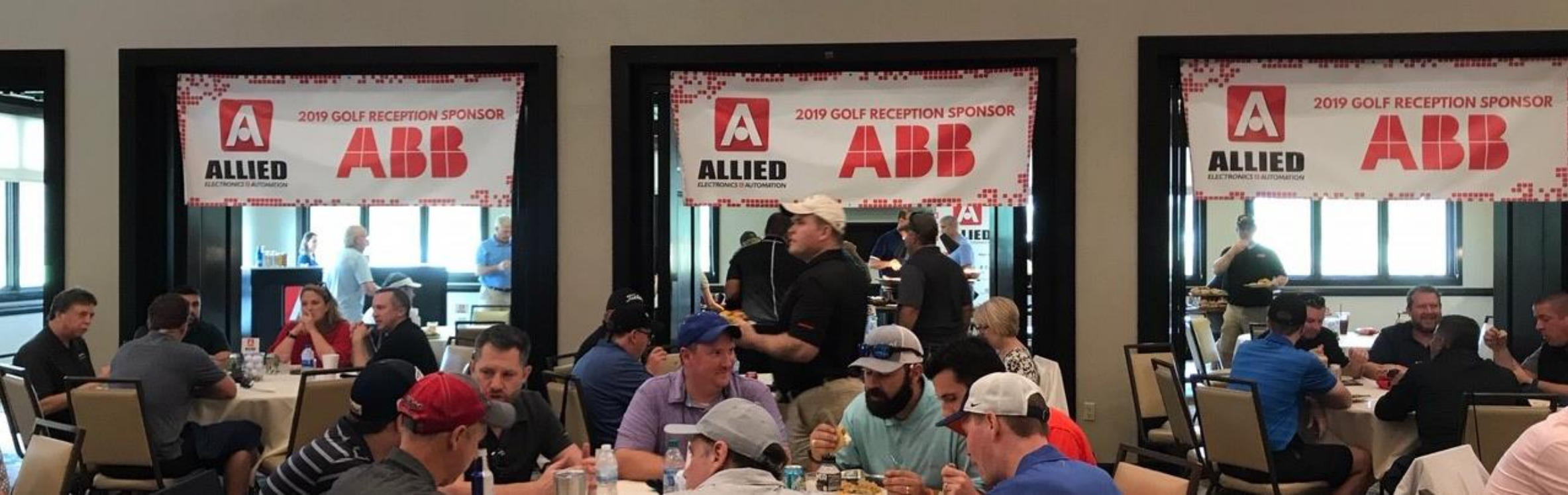
A big “thank you” to ABB for breakfast and lunch.