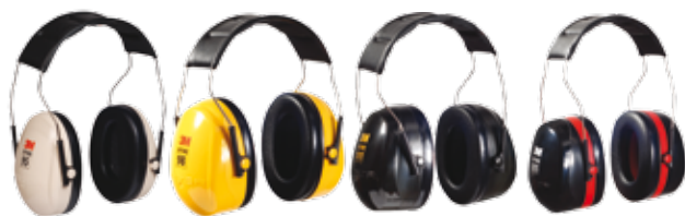
3M Peltor Optime Earmuffs: A market standard

3M Peltor Optime Earmuffs offer versatile protection that meets the needs of a majority of workplace applications.