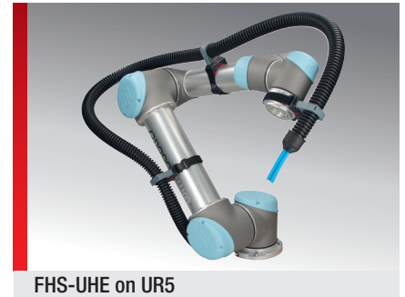
FHS-UHE on UR5