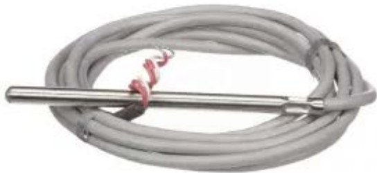
RS Stock No. 373-0372