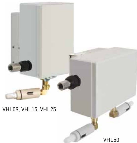
VHL09, VHL15, VHL25