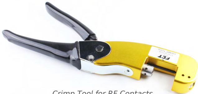
Crimp Tool for RF Contacts

www.molex.com/molex/products/family/application_tooling