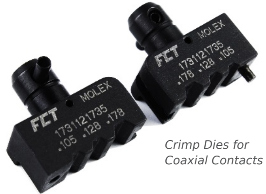
Crimp Dies for Coaxial Contacts