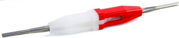
Installing and Removal Tools for D-Subs and High-Density Contacts