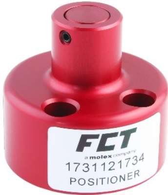
Positioner for High-Power Contacts