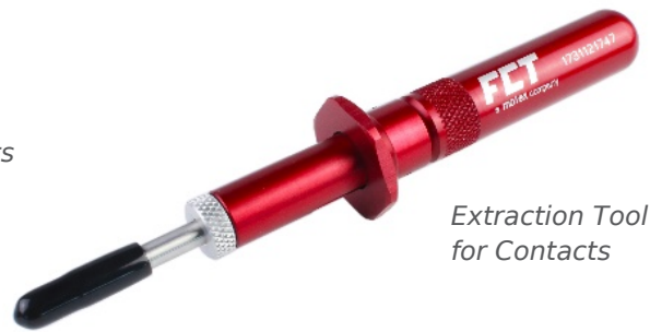
Extraction Tool for Contacts