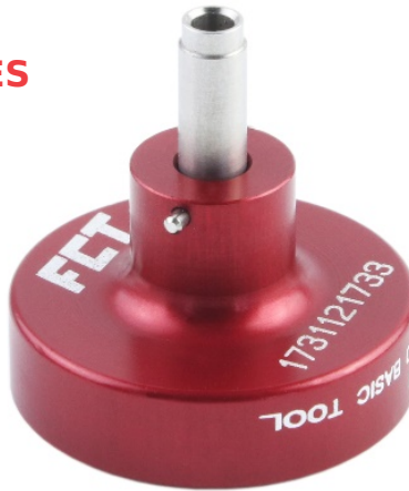
Positioner for D-Subs and High-Density Contacts