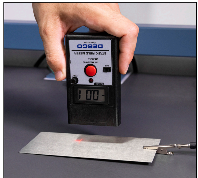
Figure 6. Pointing the Digital Static Field Meter to a grounded surface

Slide the power switch to the right to power the Digital Static Field Meter. Point the top of the Digital Static Field Meter approximately 1 inch (2.5 cm) away from a grounded metal surface. Proper spacing is indicated when the two red bullseyes emitted LED range indicator become centered on top of each other. Turn the rotary zero knob until the Digital Static Field Meter's display reads 0.00.