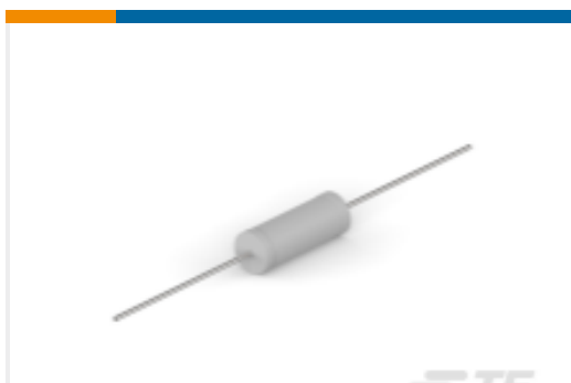
TE Part #1-2176412-5 5W XSM M/OX 5% 20R