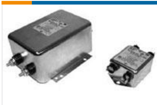
TE Part #1-6609037-4 15EMC1=F8129