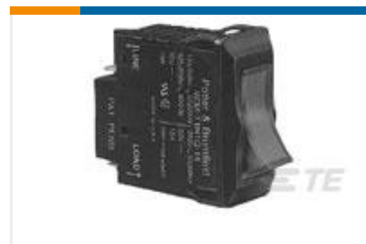
TE Part #4-1393248-2 W33-T4B1Q-10=W33