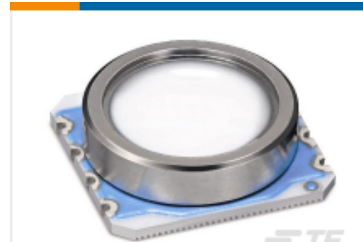
TE Part #MS580302BA01-00 MS5803-02BA01 DIGIT PRESSURE SENSOR TUBE