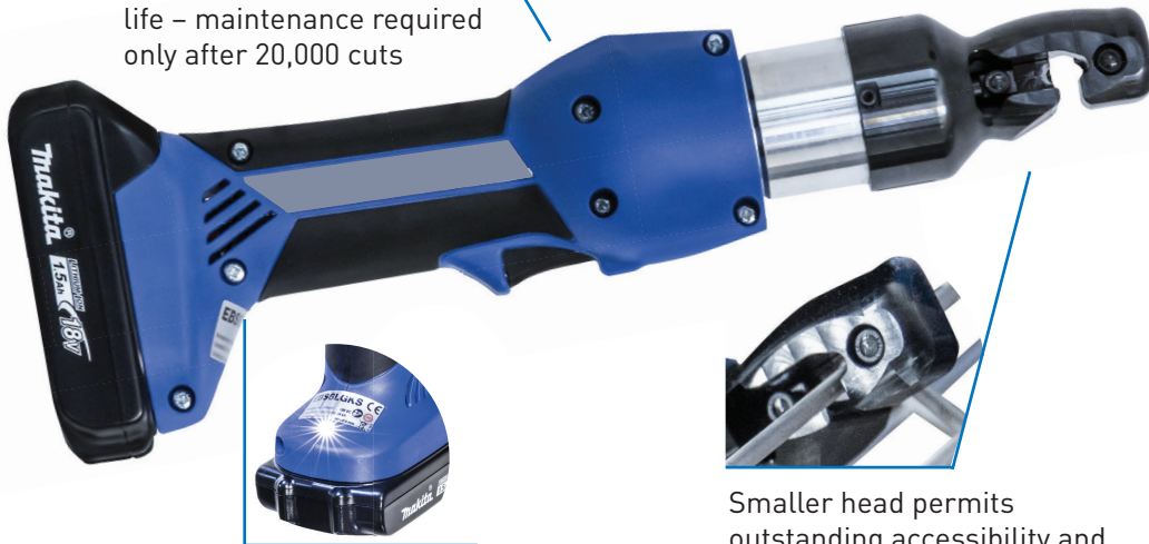
LED for workplace

Hydraulic damping system significantly extends service life – maintenance required only after 20,000 cuts