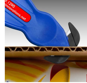
* Ask your distributor about customization!