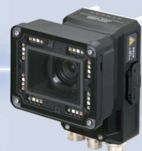
FHV7 Smart Camera

* Additional software installation may be required depending on the software version of the smart camera.