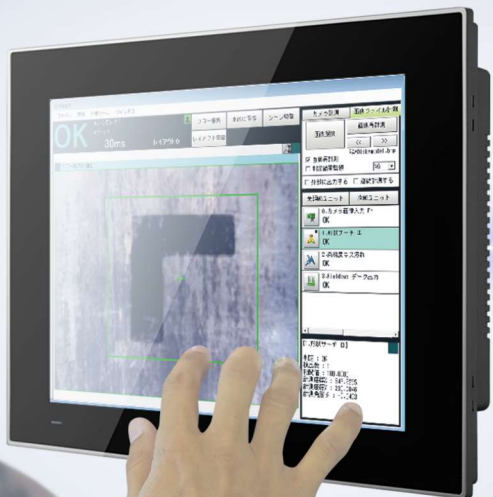
10.4" Touch Panel Monitor