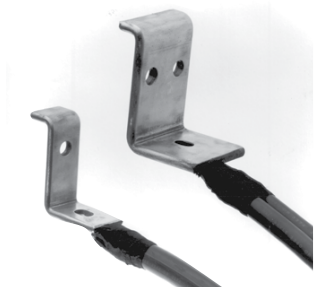
Double-sized neutral conductor handles excessive neutral currents