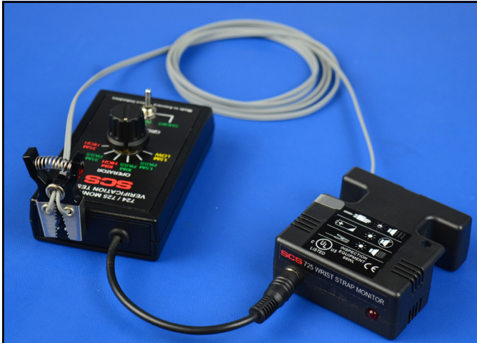
Figure 4. Using the Verification Tester with the 725 Portable Wrist Strap Monitor