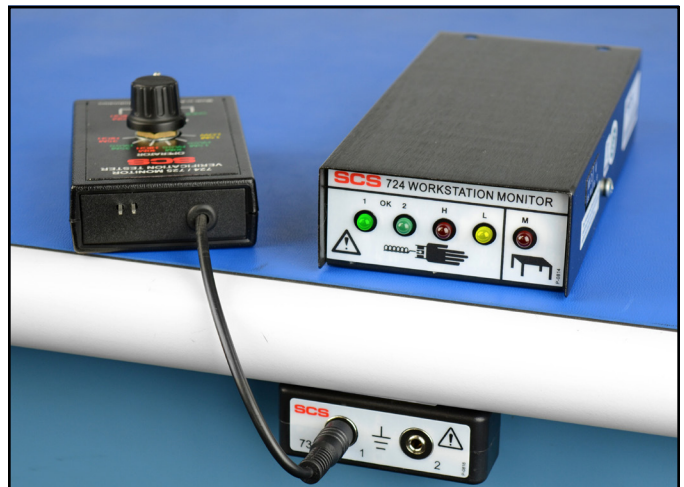
Figure 3. Using the Verification Tester with the 724 Workstation Monitor