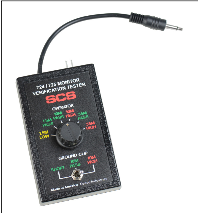
Figure 1. SCS 770065 Verification Tester