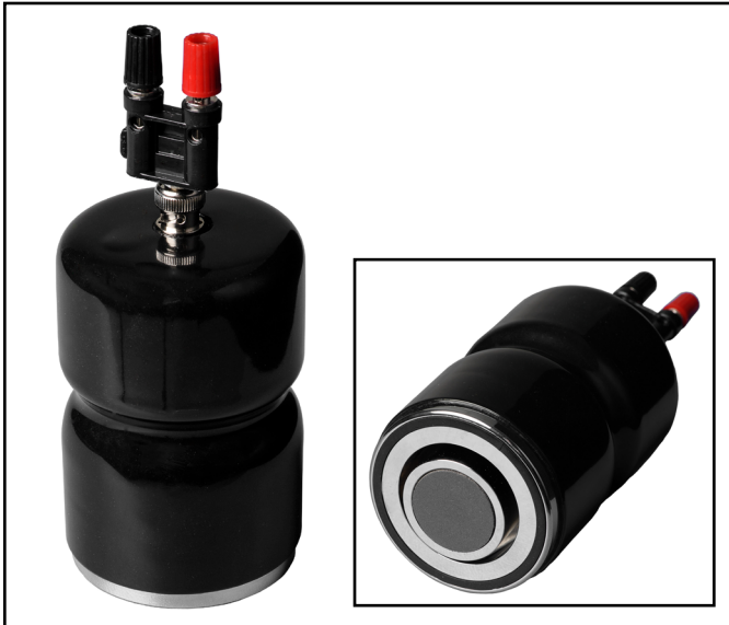
Figure 1. SCS 770007 Concentric Ring Probe