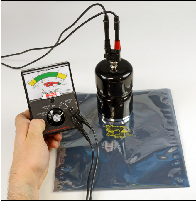
Figure 2. Using the Concentric Ring Probe with the SCS 701 Analog Surface Resistance Megohmmeter