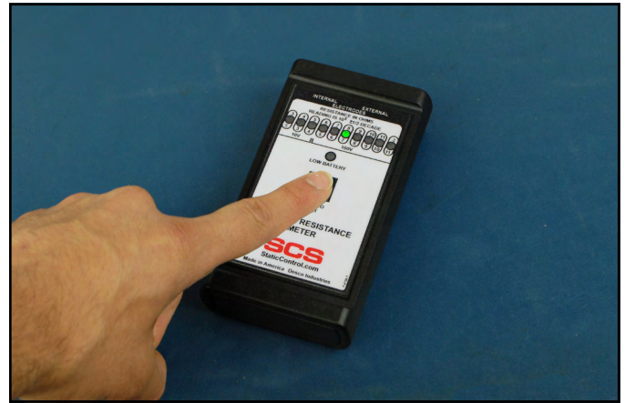
Figure 3. Using the parallel electrodes to measure surface resistance

If the measurement is outside acceptable limits, clean the surface with an ESD cleaner containing no insulative silicone such as Reztore® Surface & Mat Cleaner, and re-test to determine if the cause of failure is an insulative dirt layer or the ESD worksurface material.