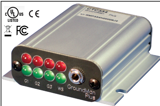
Figure 1. Ground Man Plus Ground Monitor.