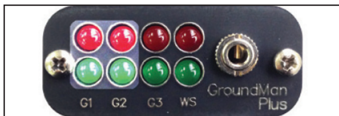
Figure 3. LED lights used to set resistance alarm level.