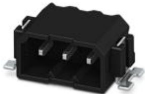
The figure shows the 3-pos. version

PCB headers, nominal current: 6 A, rated voltage (III/2): 160 V, number of positions: 6, pitch: 2.5 mm, color: black, contact surface: Tin, mounting: SMD soldering