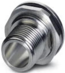
Housing screw connection, Plug, M12, Rear mounting, M15 x 1

Please be informed that the data shown in this PDF Document is generated from our Online Catalog. Please find the complete data in the user's documentation. Our General Terms of Use for Downloads are valid ( http://phoenixcontact.com/download )