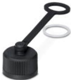
M12 sealing cap made of plastic with fixing band, for free M12 plugs with 12.0 mm fastening eye

Please be informed that the data shown in this PDF Document is generated from our Online Catalog. Please find the complete data in the user's documentation. Our General Terms of Use for Downloads are valid ( http://phoenixcontact.com/download )