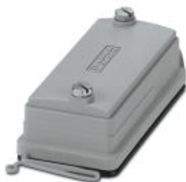
HEAVYCON ADVANCE, IP66, B10 protective cover for panel mounting side, with screw locking, with retaining cord, diameter of retaining cord eyelet: 3 mm

Please be informed that the data shown in this PDF Document is generated from our Online Catalog. Please find the complete data in the user's documentation. Our General Terms of Use for Downloads are valid ( http://phoenixcontact.com/download )