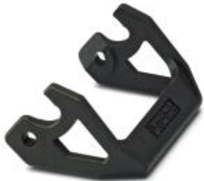
Single locking latch for B6 housing, HC-EVO....AL and HC-STA....AL

Please be informed that the data shown in this PDF Document is generated from our Online Catalog. Please find the complete data in the user's documentation. Our General Terms of Use for Downloads are valid ( http://phoenixcontact.com/download )