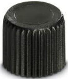
M12 sealing cap for unoccupied M12 plugs of the sensor/actuator cable, flush-type plugs and I/O devices in the field

Please be informed that the data shown in this PDF Document is generated from our Online Catalog. Please find the complete data in the user's documentation. Our General Terms of Use for Downloads are valid ( http://phoenixcontact.com/download )