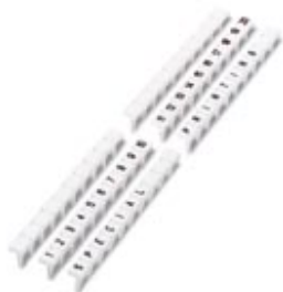
BNB Zack marker strip, 10-section, divisible, horizontally labeled with the consecutive numbers: 21 ... 30, white

Please be informed that the data shown in this PDF Document is generated from our Online Catalog. Please find the complete data in the user's documentation. Our General Terms of Use for Downloads are valid ( http://phoenixcontact.com/download )