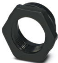
Reducing adapter, Polyamide fiberglass reinforced, connecting thread: M40 x 1.5, color: black, with flat gasket

Please be informed that the data shown in this PDF Document is generated from our Online Catalog. Please find the complete data in the user's documentation. Our General Terms of Use for Downloads are valid ( http://phoenixcontact.com/download )