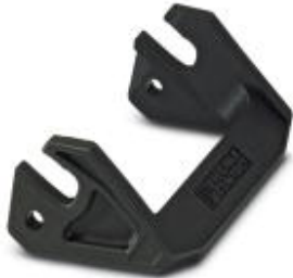
Single locking latch for B10 housing, HC-EVO...AL and HC-STA...AL

Please be informed that the data shown in this PDF Document is generated from our Online Catalog. Please find the complete data in the user's documentation. Our General Terms of Use for Downloads are valid ( http://phoenixcontact.com/download )