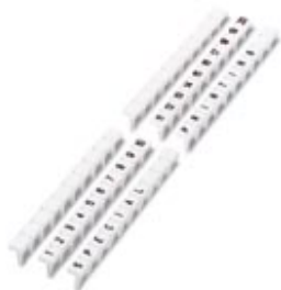
BNB Zack marker strip, 10-section, divisible, horizontally labeled with the consecutive numbers: 11 ... 20, white

Please be informed that the data shown in this PDF Document is generated from our Online Catalog. Please find the complete data in the user's documentation. Our General Terms of Use for Downloads are valid ( http://phoenixcontact.com/download )