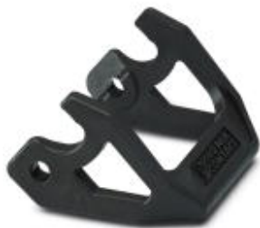
Double locking latch for B10 / B16 / B24 housing, HC-EVO....AL and HC-STA....AL

Please be informed that the data shown in this PDF Document is generated from our Online Catalog. Please find the complete data in the user's documentation. Our General Terms of Use for Downloads are valid ( http://phoenixcontact.com/download )