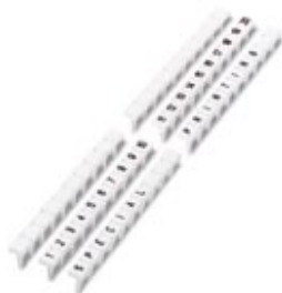
BNB Zack marker strip, 10-section, divisible, horizontally labeled with the consecutive numbers: 31 ... 40, white

Please be informed that the data shown in this PDF Document is generated from our Online Catalog. Please find the complete data in the user's documentation. Our General Terms of Use for Downloads are valid ( http://phoenixcontact.com/download )