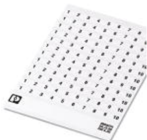
Marker card, self-adhesive, horizontally labeled with the consecutive numbers: 1 ... 10, 10-section marker strips with 12 identical decades, white

Please be informed that the data shown in this PDF Document is generated from our Online Catalog. Please find the complete data in the user's documentation. Our General Terms of Use for Downloads are valid ( http://phoenixcontact.com/download )