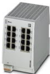
Managed Switch 2000, 16 RJ45 ports 10/100 Mbps, degree of protection: IP20, PROFINET conformance, class B

Please be informed that the data shown in this PDF Document is generated from our Online Catalog. Please find the complete data in the user's documentation. Our General Terms of Use for Downloads are valid ( http://phoenixcontact.com/download )