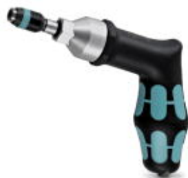
Torque screw driver, accuracy as per EN ISO 6789 standard, adjustable from 3 - 6 Nm

Please be informed that the data shown in this PDF Document is generated from our Online Catalog. Please find the complete data in the user's documentation. Our General Terms of Use for Downloads are valid ( http://phoenixcontact.com/download )