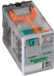
792 Full-Feature Cover