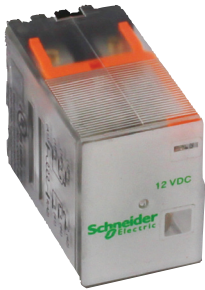
792 Clear Cover

UL Listed when used with corresponding sockets