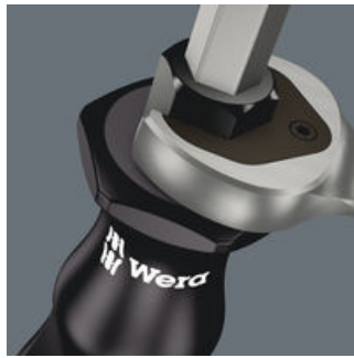
Hexagonal blade and bolster for higher torque transfer.