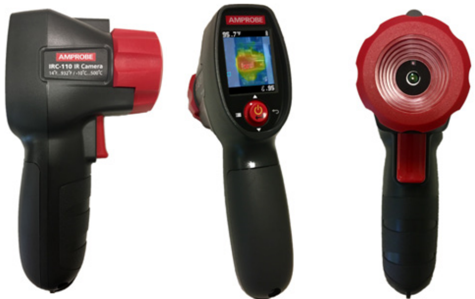
IR-110 Infrared Camera

All Amprobe tools, including the Amprobe IR-110, are rigorously tested for safety, accuracy, reliability, and ruggedness in our state-of-the-art test lab. In addition, Amprobe products that measure electricity are listed by a 3rd party safety lab, either UL or CSA. This system assures that Amprobe products meet or exceed safety regulations and will perform in a tough, professional environment for many years to come.