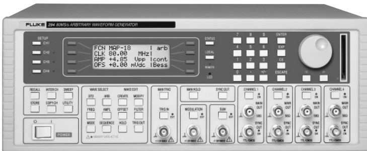
294 Waveform Generator