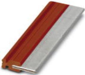
Plug-in bridge, length: 50 mm, color: red

Please be informed that the data shown in this PDF Document is generated from our Online Catalog. Please find the complete data in the user's documentation. Our General Terms of Use for Downloads are valid ( http://phoenixcontact.com/download )