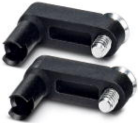
Replacement cable guide 1.5 mm 2 , for sleeve feed CF 3000 HZG 1,5

Please be informed that the data shown in this PDF Document is generated from our Online Catalog. Please find the complete data in the user's documentation. Our General Terms of Use for Downloads are valid ( http://phoenixcontact.com/download )