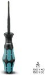
Screwdriver, crosshead PH (lasered), insulated, size: PH 1 x 80, 2-component handle, with non-slip grip

Please be informed that the data shown in this PDF Document is generated from our Online Catalog. Please find the complete data in the user's documentation. Our General Terms of Use for Downloads are valid ( http://phoenixcontact.com/download )