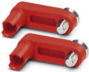
Replacement cable guide 1.0 mm 2 , for sleeve feed CF 3000 HZG 1,0

Please be informed that the data shown in this PDF Document is generated from our Online Catalog. Please find the complete data in the user's documentation. Our General Terms of Use for Downloads are valid ( http://phoenixcontact.com/download )