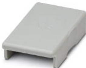
Protective end covers for TMC 8 bus bars

Please be informed that the data shown in this PDF Document is generated from our Online Catalog. Please find the complete data in the user's documentation. Our General Terms of Use for Downloads are valid ( http://phoenixcontact.com/download )