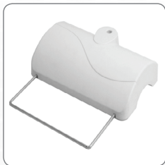
Weighted Table Base Item # 26501-WB