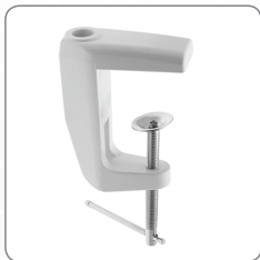
Heavy Duty Mounting Clamp