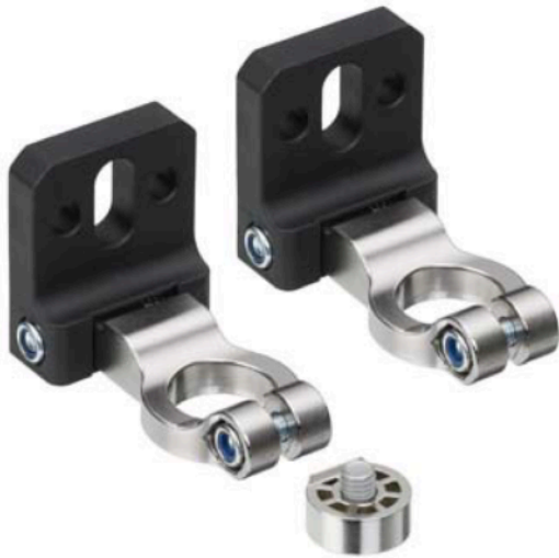
Part no.: 429393 BT-2HF Mounting bracket set