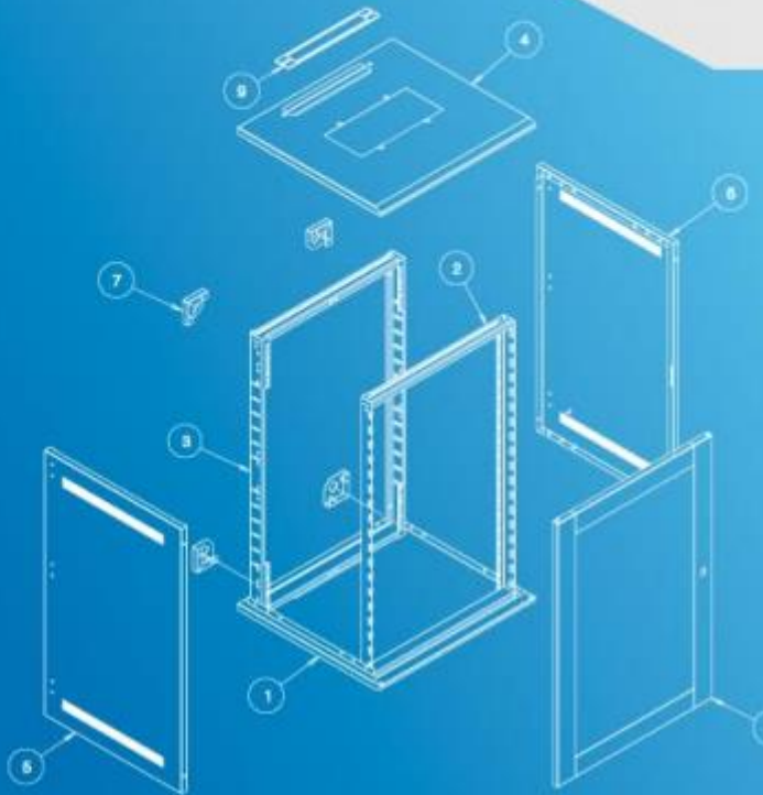
ISOMETRIC VIEW AND DIMENSIONS OF 6U WALLNET