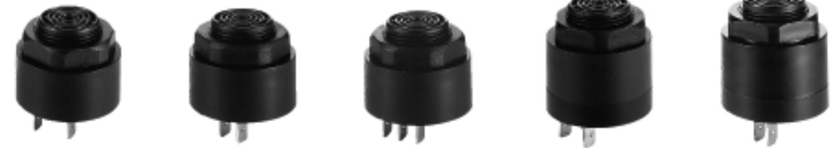
KPE-650/650A KPE-650AN/610AN KPE-648