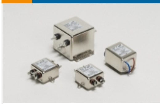
Single Phase Filters(9)