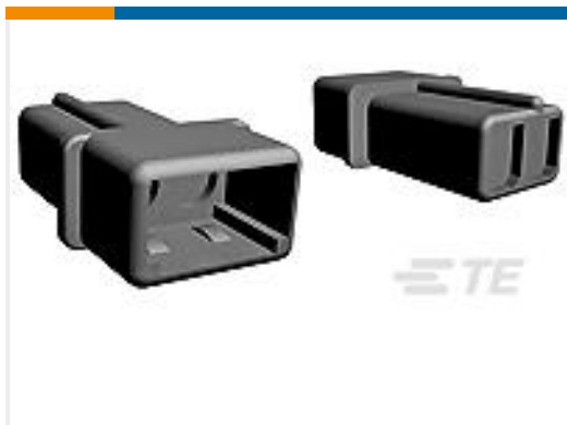
TE Model / Part #1-480724-0 02P CMNL CAP HSG F/H D /L NATL