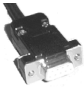
ASi Master in IP65 (Specification 2.0)