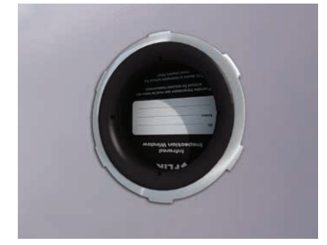
Single PIRma-Lock™ ring nut.