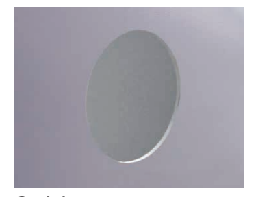
One hole to cut.