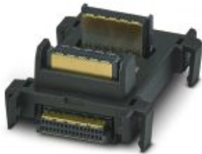
Bus base module for left-aligning the AXC F 2xxx controllers

Please be informed that the data shown in this PDF Document is generated from our Online Catalog. Please find the complete data in the user's documentation. Our General Terms of Use for Downloads are valid ( http://phoenixcontact.com/download )